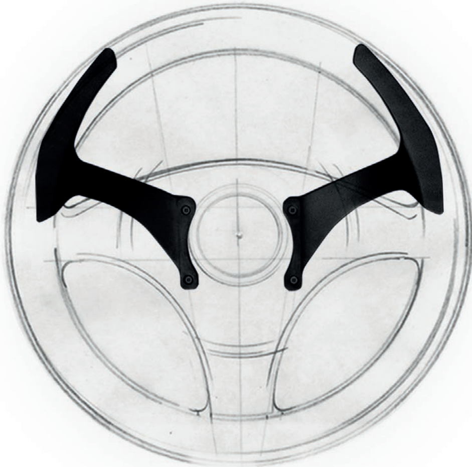
3D Printed steering wheel-mounted paddle shifters