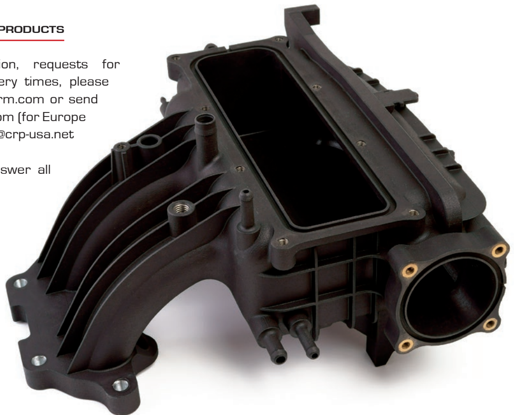
3D printed Automotive intake manifold functional prototype

We will be in contact to answer all inquiries.