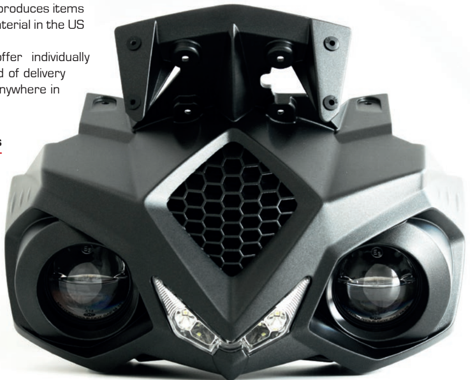
Energica Eva electric motorbike 3D printed front nose finished and used for pre-production series

We will be in contact to answer all inquiries.